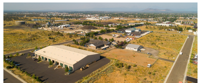
Redmond Industrial Zone | Desert Rise

Eligible businesses must provide 75% or greater of its goods, products or services to other business operations or organizations. Typically, this requirement makes the following types of operations ineligible: entertainment, tourism, health care, child care, finance, housing, construction, and retail. Please contact the Zone Manager with eligibility questions.